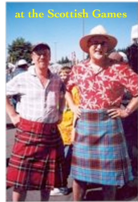
at the Scottish Games

mountains and ocean); and made a final stop at a gelato store featuring 208 flavors (from balsamic vinegar to garlic to lavender to blackberry jalapeño)! In addition, I was took some other day trips: Snoqualmie Pass (February) to hike in the snow; Bloedel Reserve (August), a 150-acre private wildlife sanctuary with woods, meadows and gardens; the Scottish Highland Games (July), a cultural festival in the shadow of Mt. Rainier; and a few trips to the gay campground in North Cascades.