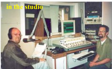
in the studio

Another highlight was hosting an hour-long radio show spotlighting contemporary Israeli music, produced by a friend at a community radio station, and broadcast on Mother's Day. I had a great time choosing and researching the songs, and writing and recording the script. If you're interested, the show can be heard (in 5 segments) at www.putfile.com/risaac , or downloaded at www.tinyurl.com/ajgz6 (one segment). I hope to do another show in the coming year; the iBook I got in October should make it much easier to choose from among the 2500 songs I have loaded into iTunes.