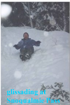
glissading at Snoqualmie Pass